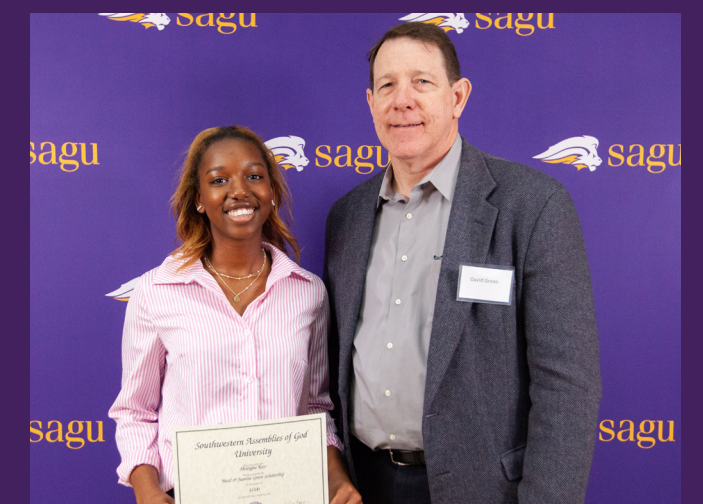
Recipients of Donor Scholarships 2022