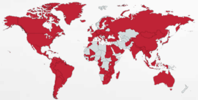
Within a ten-year span, the Mission TEN initiative sent SAGU students to 165 nations, including 20 states of India, 15 provinces of China, and 28 U.S. states.